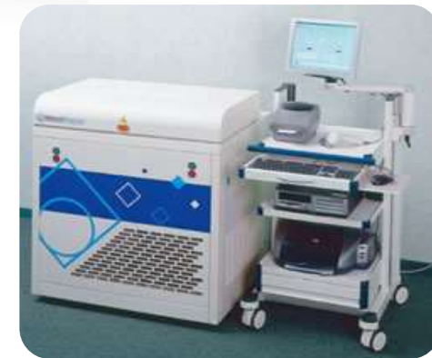
Macopharma Theraflex MB