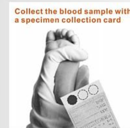
Collect the blood sample with a specimen collection card

Collect the blood sample with a capillary tube (or similar device) and fill the blood collection container until the required volume is obtained. Gently press a dry sterile gauze pad on the incision site until the bleeding stops.